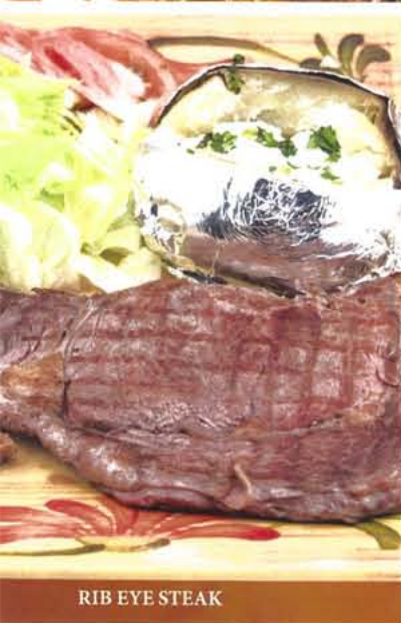
RIB EYE STEAK