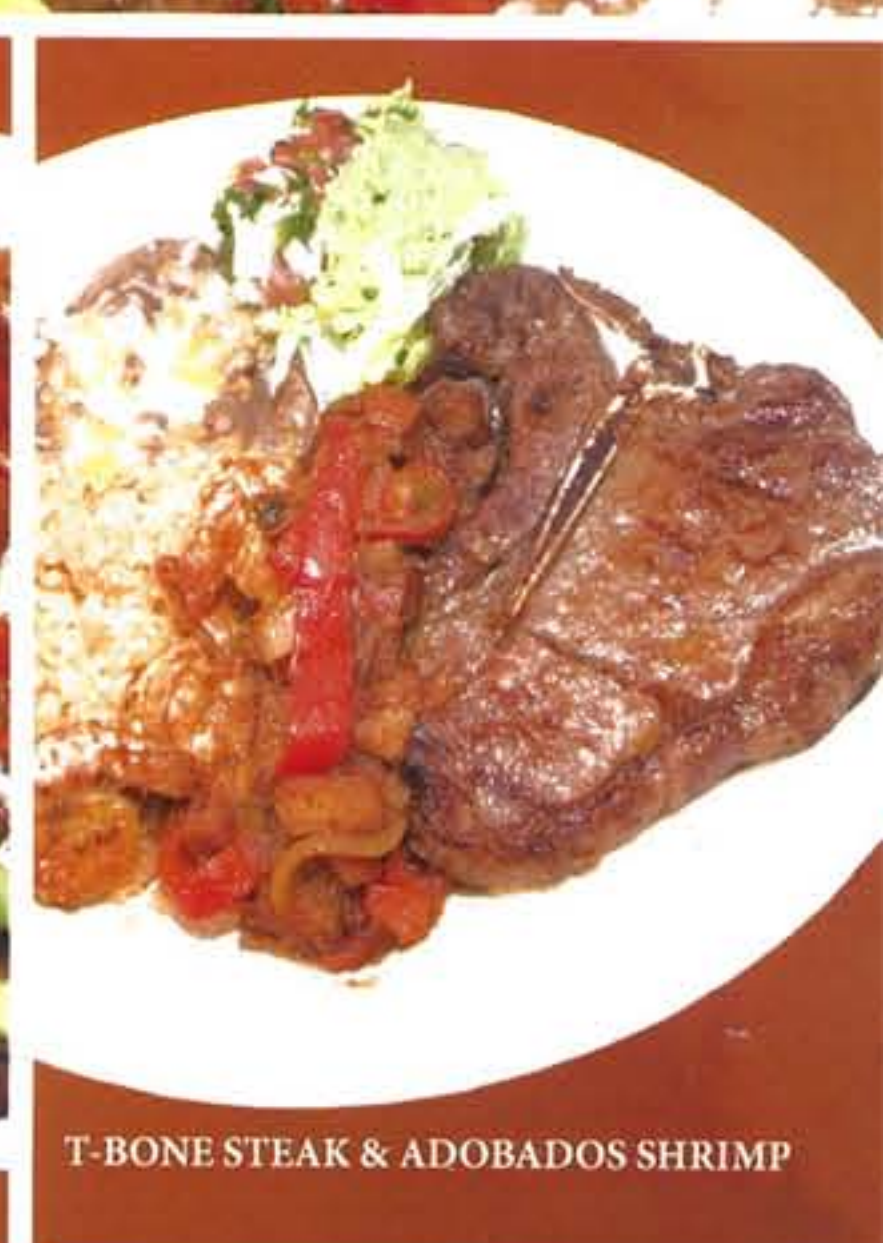
T-BONE STEAK & ADOBADOS SHRIMP