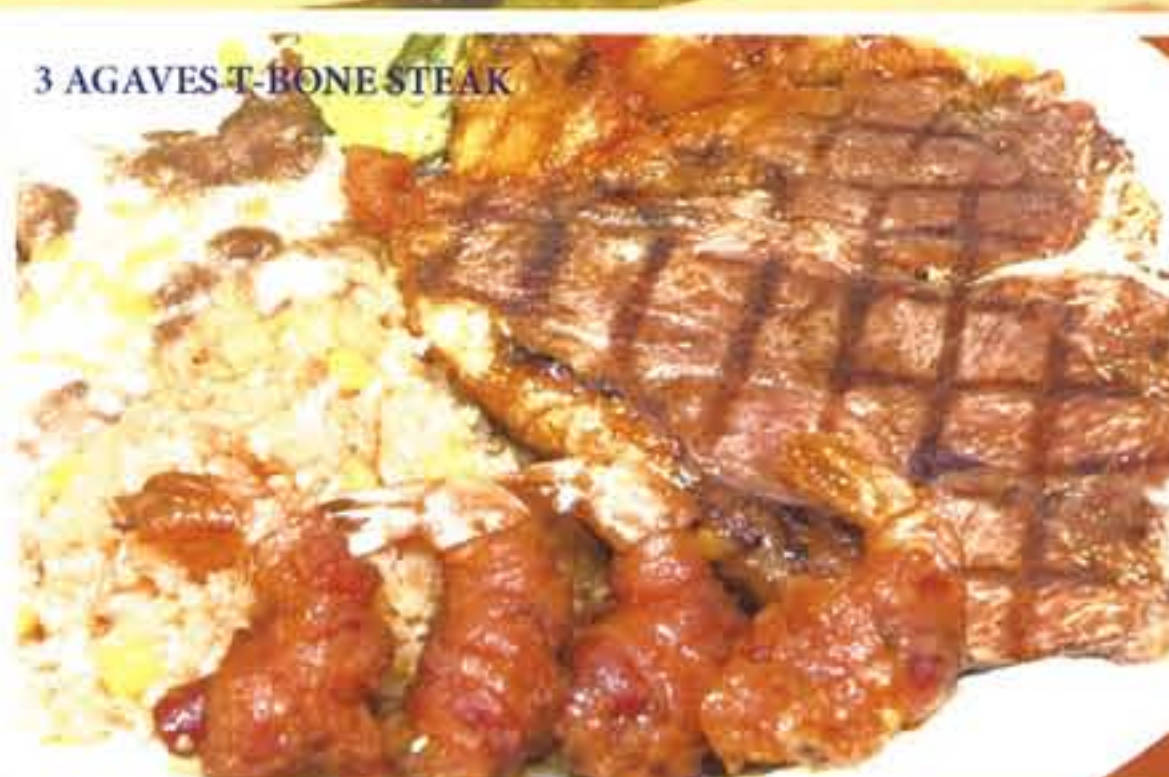
3 AGAVES T-BONE STEAK