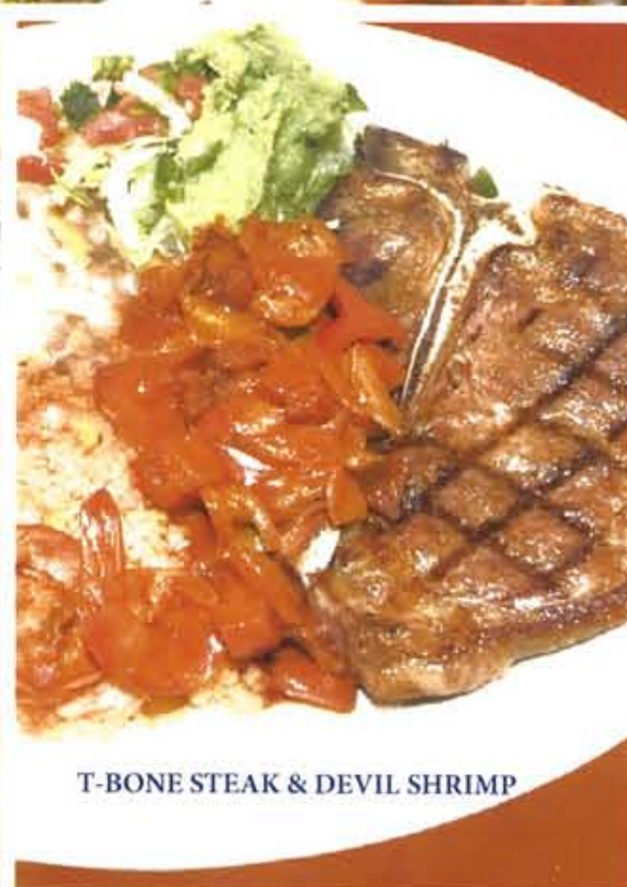
T-BONE STEAK & DEVIL SHRIMP